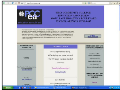
PCCEA Home page (extends for 4 pages)