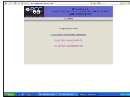
PCCEA Sub page